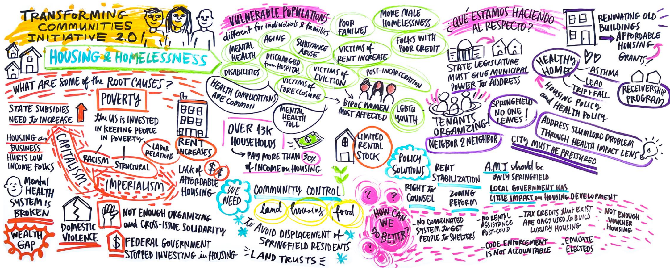
Transforming Community Initiative 2.0 | Housing and Homelessness Advisory Committee Meeting - March 23rd, 2023